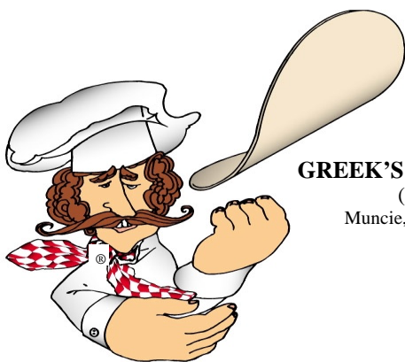
GREEK'S PIZZERIA (Co-Brand) Muncie, IN Since 1978

Contact Management for Pizza Forum® & Greek's Pizzeria® Franchise Information.